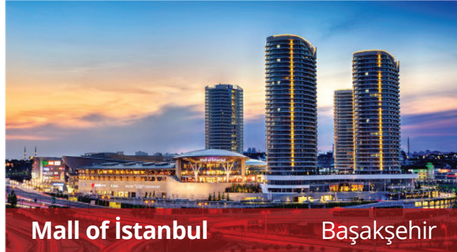
Mall of İstanbul