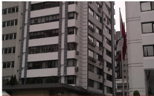
Oyal İş Merkezi