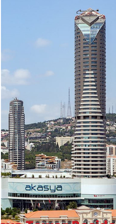
Akasya Tower Residence