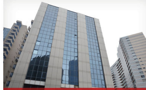
Pol Center Plaza