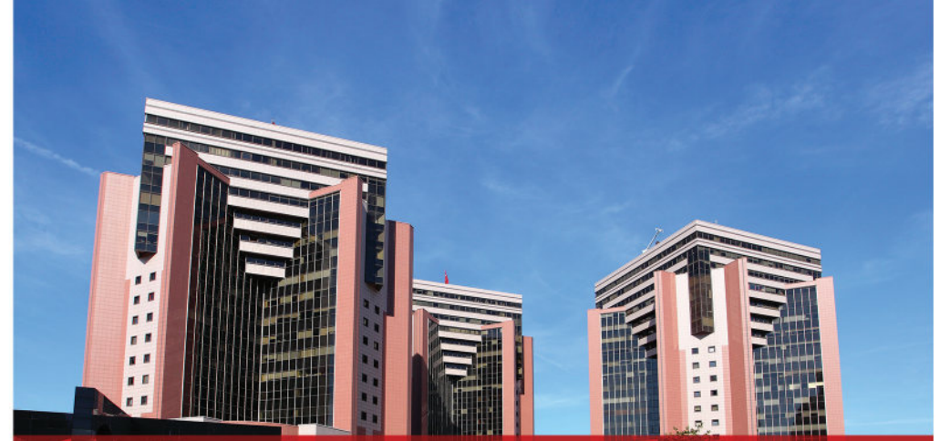
EGS Business Park