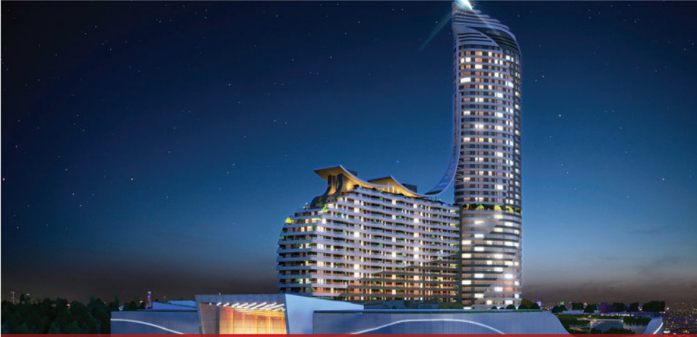
Akasya Residence Tower