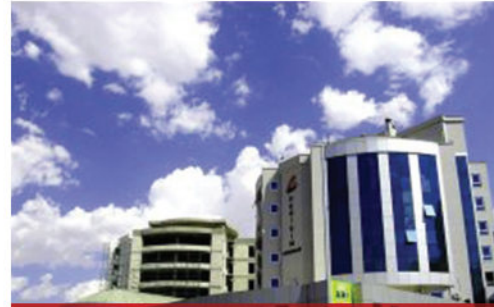
Milenyum İş Merkezi